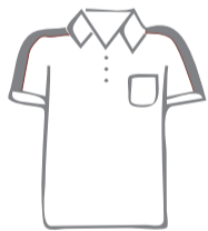
College Polo Top