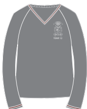
Year 12 Jumper