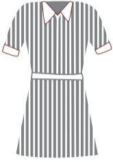
College Dress Length to be just above the knee