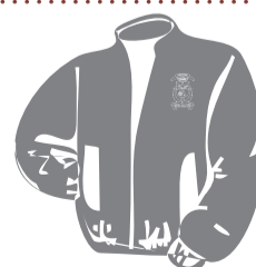
College Sports Spray Jacket