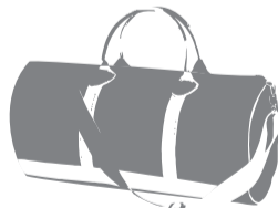
College Sports Bag