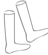
College Knee Length White Socks