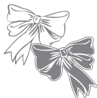
Ribbons Black or White Please note that scrunchies are not approved uniform items