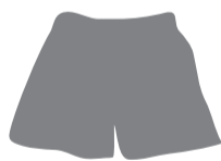
College Sport Shorts