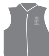
College Sports Fleece Vest