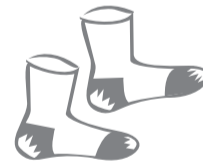
College Sports Socks White