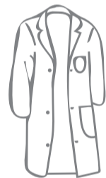
Regulation Laboratory Coat