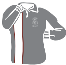
College Rugby Top