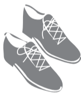
Black Lace Ups