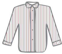
College Winter Shirt Worn tucked into the winter skirt or pants