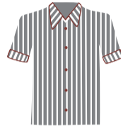
College Summer Shirt (Short Sleeved) May be worn tucked in or left out