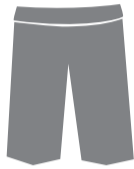
College Shorts Worn with white socks