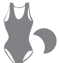
College Swimsuit/Cap Worn for interschool swimming